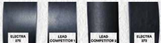
Surface Smoothness Tape